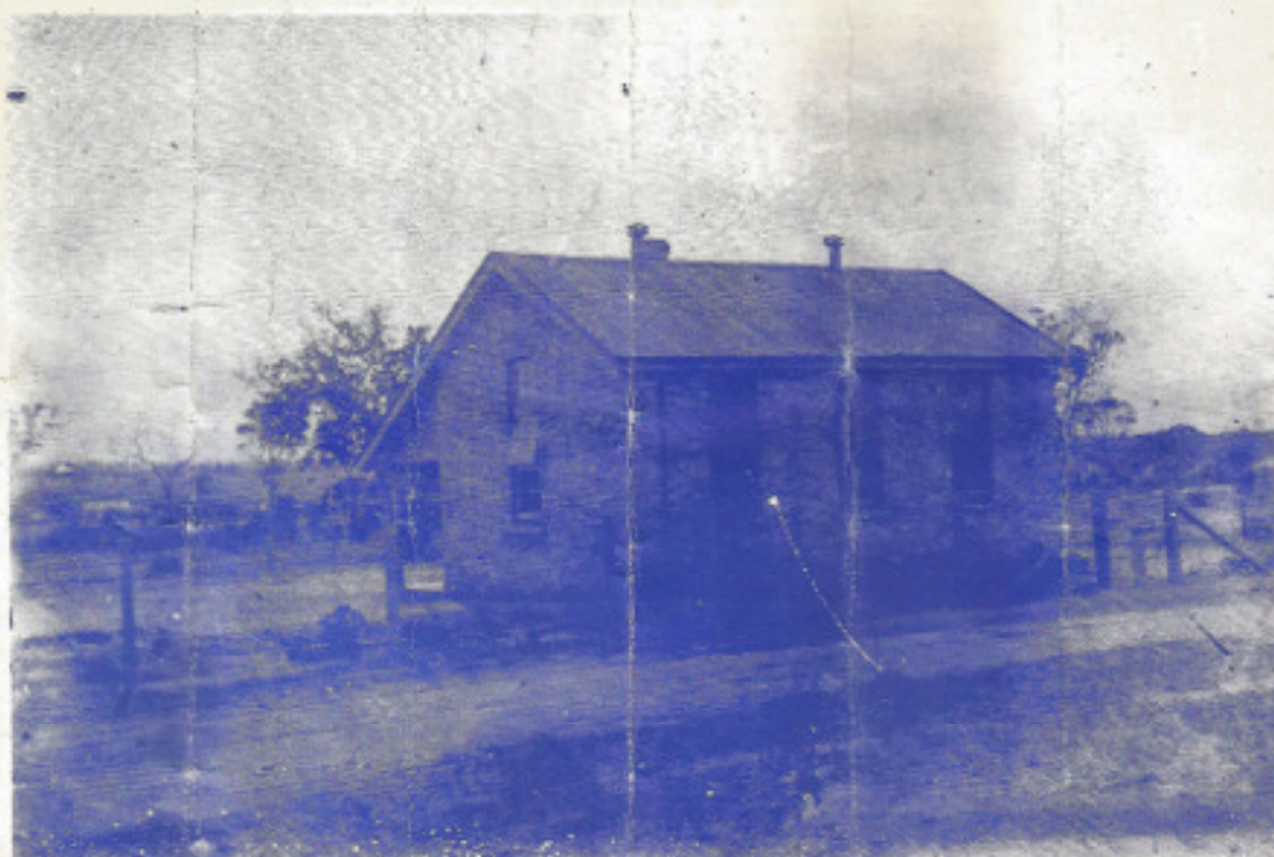
Katanning's First Permanent School Building Situated at the corner of Amable and Taylor Streets it is now a Museum.

PART OF KATANNING'S CENTENARY CELEBRATIONS 1889-1989